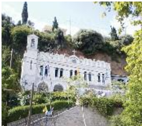
THE CHURCH OF PANAGIA TRIPITI AIGIOU

icon of the Virgin Mary was found in a 'trypa' (hole) in the rock, i.e. in a small cave, by a shipwrecked man who was also the first ascetic in this place.