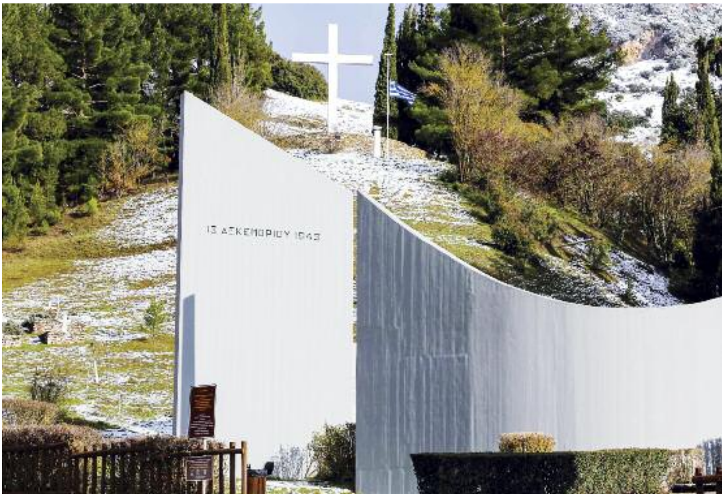
THE MASSACRE OF KALAVRYTA PLACE OF SACRIFICE MEMORIAL