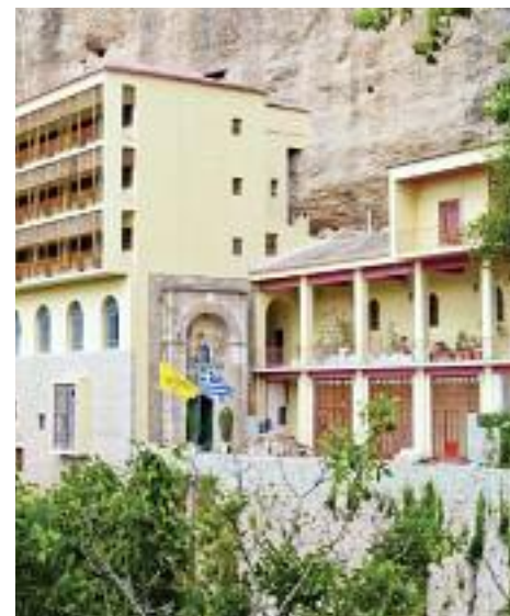
HOLY MONASTERY OF THE GREAT CAVE

stroyed, set on fire, and repaired at various times.