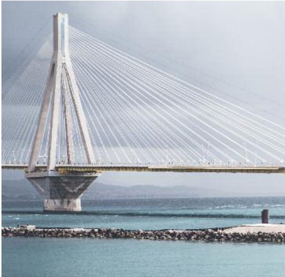
BRIDGE OF RIO-ANTIRIO