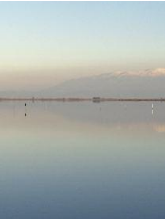
LAGOON OF MESSOLONGHI

the River Neda . The forest of Foloi with its colossal oak trees enchants the visitor. The forest trails lend themselves to walks and cycling. Lake Kaiafa looks like the work of an inspired artist, and walks around its shores, pondering its incredible blue dazzle, are delightful. In the Alfios , water lovers will enjoy rafting through a veritable tunnel of plants and trees.