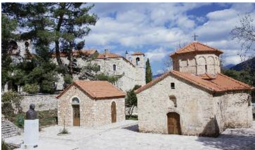
HOLY MONASTERY OF AGIA LAVRA

The monastery has a rich library with rare books and documents, and a museum with unique items from the Greek Revolution. Among them, the very banner raised by the Metropolitan Germanos when he proclaimed the Revolution of 1821, a diamond-encrusted gospel – a gift from Empress Catherine of Russia, and the vestments of Germanos. It also has relics of saints and the reliquary of Saint Alexios, patron saint of Kalavryta, donated by the Byzantine emperor Manuel Palaiologos in 1398.