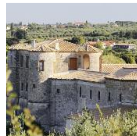
MONASTERY OF PANAGIA SKAFIDIA

is the earliest monastery of the prefecture, with the first church built on the site dating back to the 7th century. The monastery was built around the 10th century around the original church, and during the Venetian occupation the impressive medieval towers were added. In addition to its remarkable architecture, it also has many religious and historical treasures such as: sacred objects, chalices, relics, clothing, weapons, icons, coins, and the banner of the Monastery made from a hand-sewn icon dedicated to the Virgin Mary.