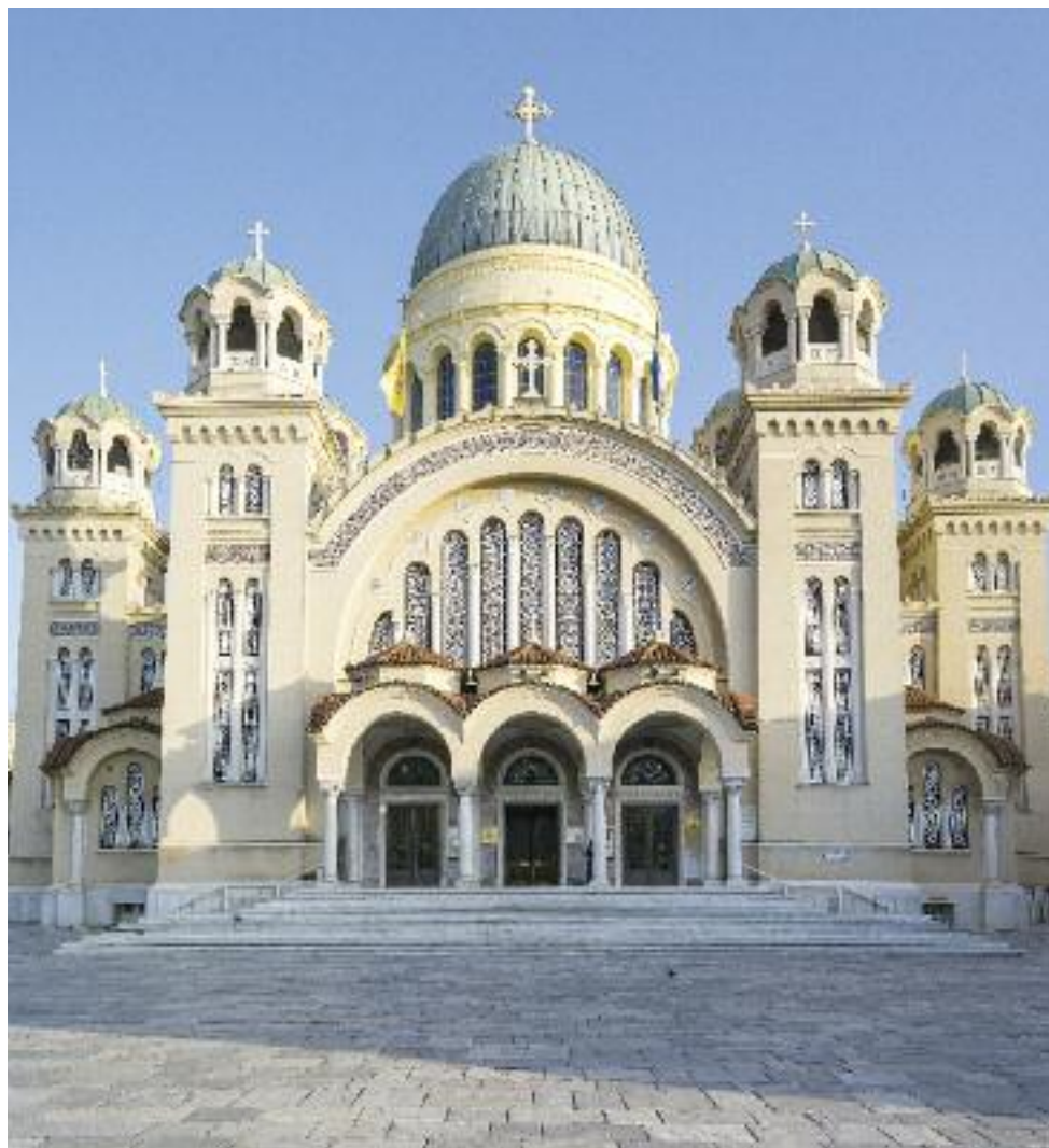
ST ANDREAS PATRAS

is carved partly out of a vertical rock, in a landscape of outstanding natural beauty. The majestic and imposing church is dedicated to the Virgin Mary as 'the Life-Giving Spring'. The name 'Trypiti', according to tradition, is due to the fact that the miraculous